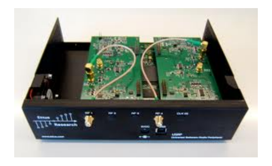
Figure 4. Ettus Research USRP1 kit.