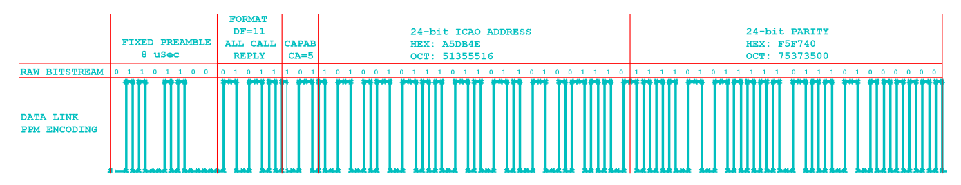
Figure 2. PPM-encoded ADS-B 56 bit sample frame.

probability of existence Mostly observed in intentional or unintentional prankster group, as shown in [47];