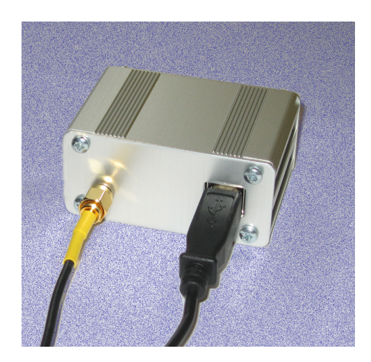
Figure 6. PlaneGadget ADS-B Virtual Radar.

1) Overview: As our main software base, we are using the GNURadio [48] open-software package. GNURadio is